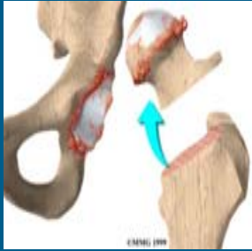
Removal of femoral head during primary total hip replacement

“ Femoral Head Donation is a voluntary donation by informed consent, it does not alter the way the surgery is performed, there is no age limit and no cost to the donor”